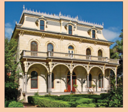
The Downtown/Southtown Route passes by the Steves Homestead Museum, a three-story residence built in 1876.

Public restrooms can be found in Rivercenter Mall and La Villita Historic Arts Village.