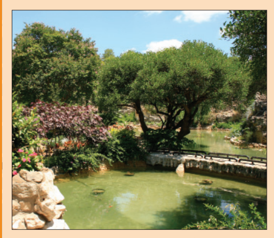
The Japanese Tea Gardens feature beautiful floral displays, a waterfall and a safe habitat for new Koi and aquatic plants.

As you leave the park, you'll travel along Avenue B, which is a dedicated, family friendly bike path, and then you'll hit Josephine St. which will lead you to N. Alamo St. which will take you back toward downtown.