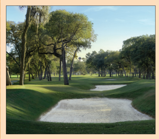
This Brackenridge Park Golf Course was designed in 1915 and is the the oldest 18-hole public course in the state.

DISCLAIMER The City of San Antonio does not guarantee the accuracy, adequacy, completeness, or usefulness of any information. Individuals assume all risk and responsibility. Please note that many of these routes mix with urban vehicular traffic.