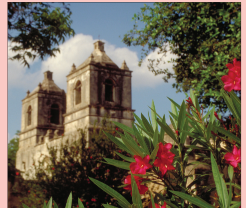
Mission Concepción stands proudly as the oldest unrestored stone church in the U.S.

The Visitor Center at Mission San José offers exhibits and a short video about the history of the missions. You'll find water fountains and restrooms at each mission.