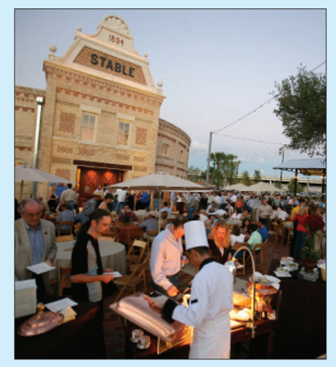
Once home to the brewery's draft horses, Pearl Stable now provides a unique site for various events.