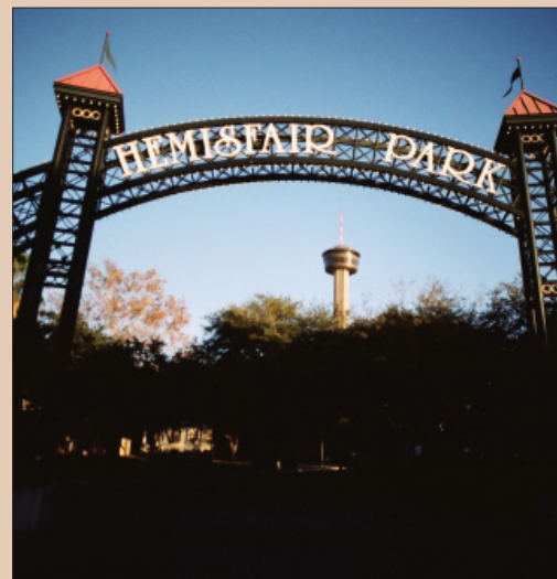
HemisFair Park was built to host the 1968 World's Fair and is home to the famous Tower of the Americas.

DISCLAIMER The City of San Antonio does not guarantee the accuracy, adequacy, completeness, or usefulness of any information. Individuals assume all risk and responsibility.