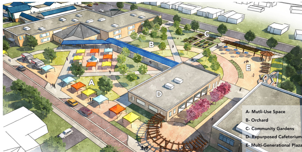
Intergenerational Education Plaza & Community Garden / Orchard - Aspirational Illustration