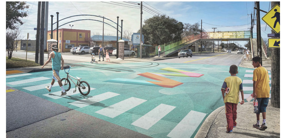
Castroville Road and Dahlgreen Avenue Intersection - Aspirational Illustration

The themes of safe multimodal access and community gardening both carry over into the proposed redesign of Athel street which runs north and south on the west side of the elementary school and the Madonna Neighborhood Center. Improvements range from simple lane striping to better define the street space, to a new multi-use path lined with street trees and planter boxes. The Athel Street design may also need to accommodate safe drop-off for Kindergarten through Second Grade students if COVID concerns continue and multiple entrances are required for the safety of students and school staff and faculty.