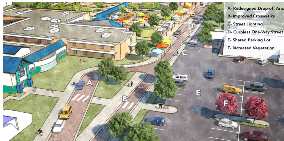
Gardendale Elementary Improved Student Drop-off Area - Aspirational Illustration

The Huerta at Gardendale also includes renovations of an unused school cafetorium building into a flexible community center available for a variety of classes, meetings, and events. Renovation work would be extensive to bring the building up to code and to successfully integrate it with the surrounding plaza.