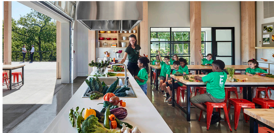
Open Air Cafetorium / Multi-Use Community Center