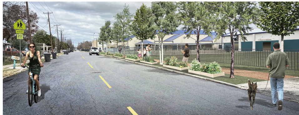
Athel Avenue - Aspirational Illustration

Gardendale Elementary and St. Martin de Porres Parish across Dahlgreen Avenue have an existing understanding that allows overflow school parking to utilize the church parking lot. Repurposing the school parking lot as the plaza and orchard will require a more formal shared parking agreement allowing teachers and staff to use the church parking during school hours. The parish also owns the large vacant lot south of its parking lot and is starting to explore ideas for how that could be used to benefit the church and surrounding community in the future.