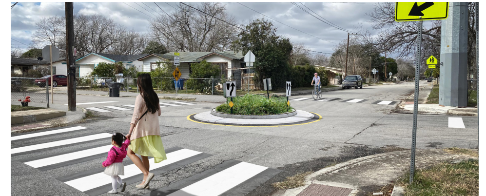
Ceralvo Street - Aspirational Illustration